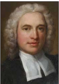
Charles Wesley 1707-1788

I rest beneath the Almighty's shade; My griefs expire, my troubles cease; Thou, Lord, on whom my soul is stayed; Wilt keep me still in perfect peace.